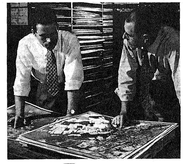
Using aerial photographs to check boundaries.