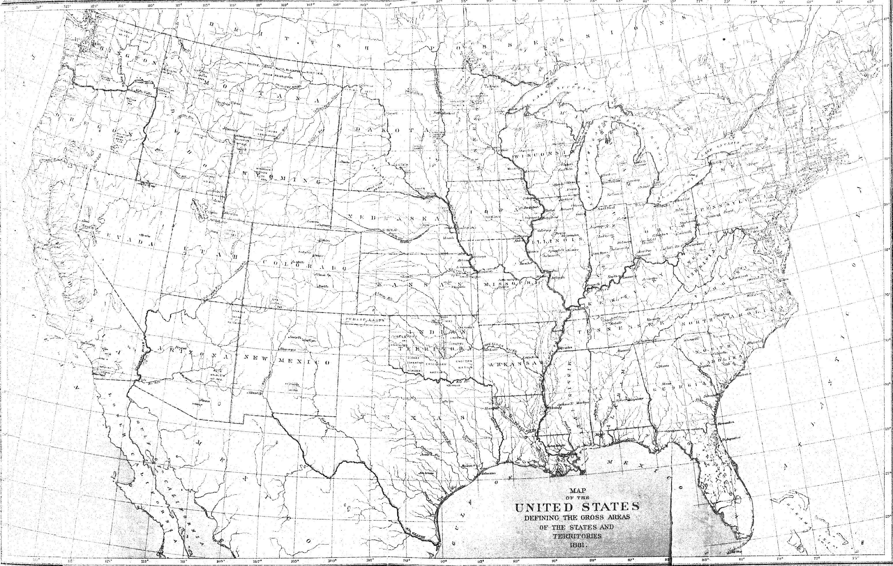
MAP OF THE UNITED STATES DEFINING THE GROSS AREAS OF THE STATES AND TERRITORIES 1881.