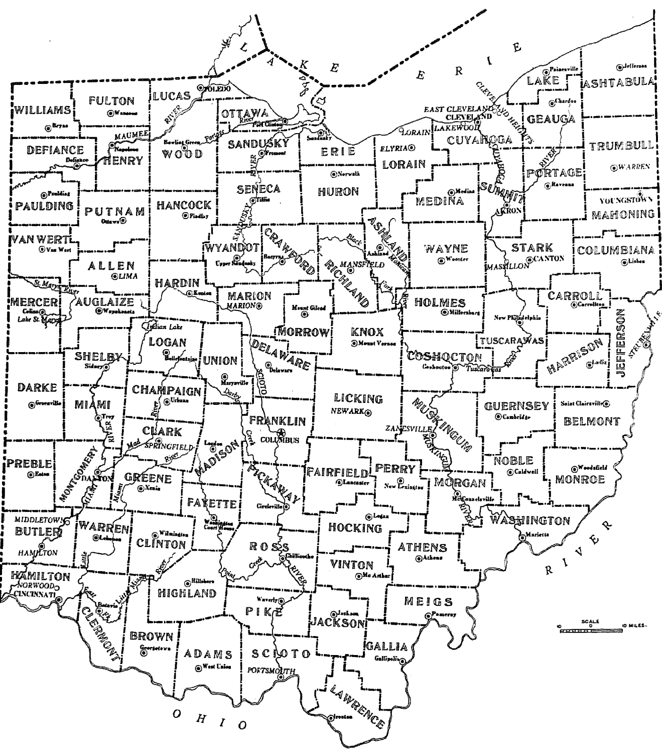
OHIO COUNTIES, PRINCIPAL CITIES, AND RIVERS